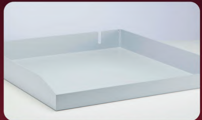
COLLECTING TUB OPTION: 119464-4-2