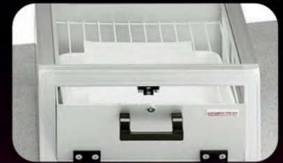
DOCUMENT HUMIDIFIER OPTION: 118258-K-9