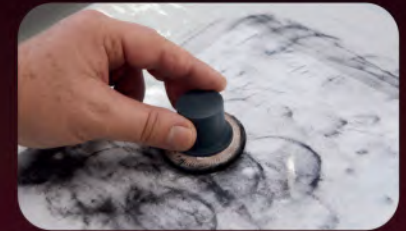
TONER PAD OPTION: 112160-4-9